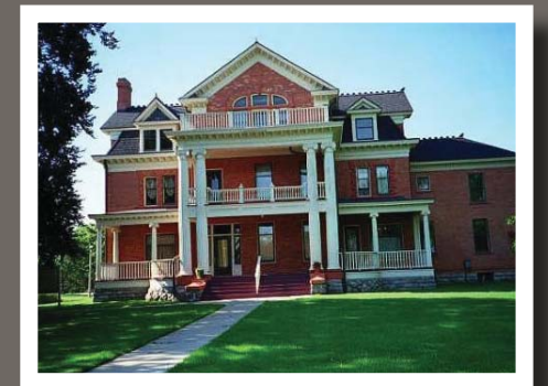
Turner-Dodge House (1850)