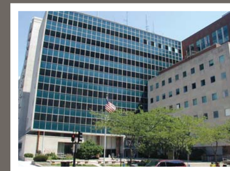
Lansing City Hall (1958)