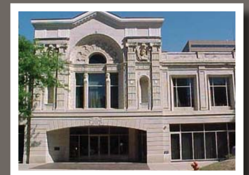
Strand Theatre (1921)