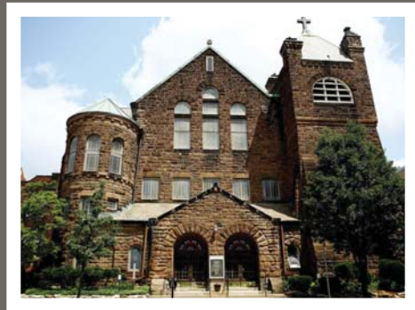
Central United Methodist Church (1890)