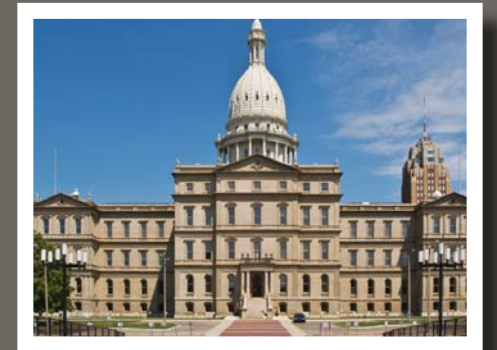
State Capitol (1879)